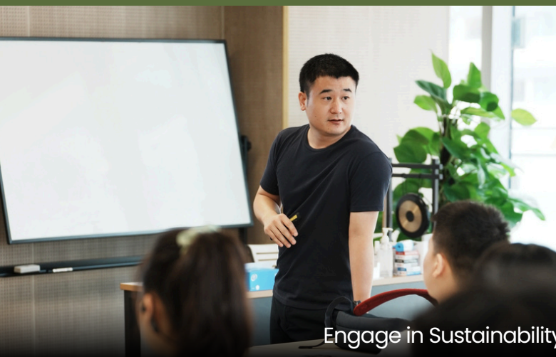
Engage in Sustainability Lectures & Workshops