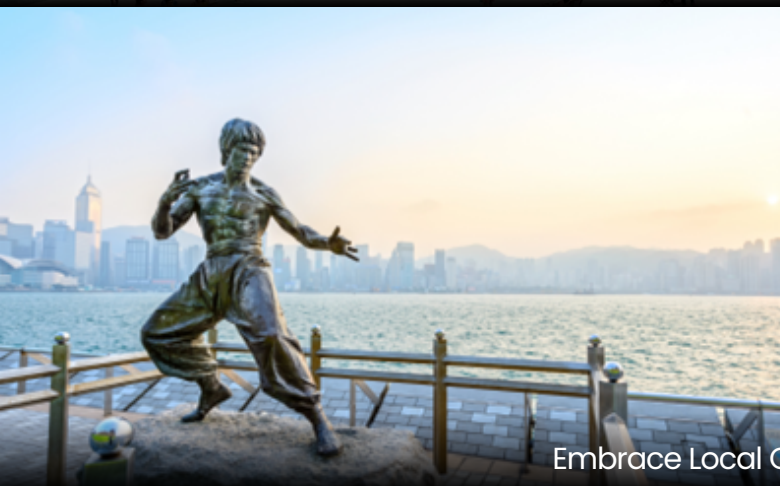
Embrace Local Cultural Heritage