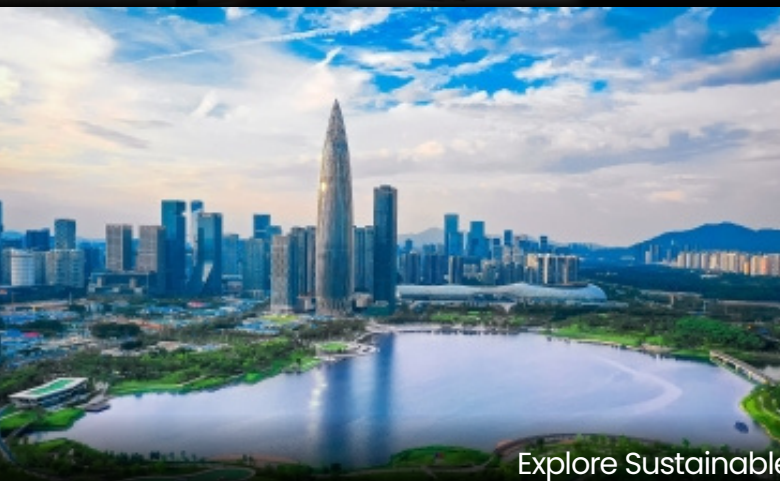
Explore Sustainable City Infrastructure