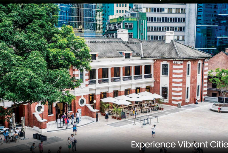
Experience Vibrant Cities Through Guided Tours